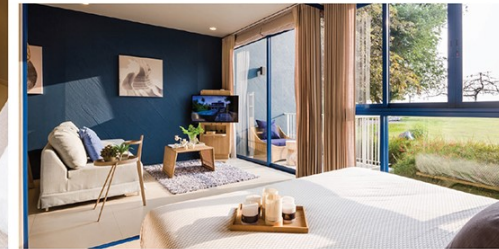
*Specifications and finishing details are approximate and subject to change without prior notice.